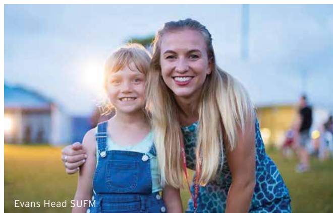
Evans Head SUFM

We will continue to build strong relationships between volunteer leaders and the staff team supporting them.