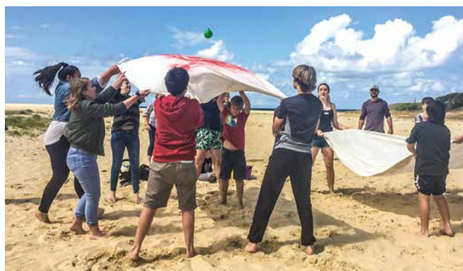
Students at Above & Beyond .

Allow this wonderful work to continue! Consider making a donation to our tax-deductible Schools fund, for an impact that truly goes above and beyond the classroom: suns.org.au/donate .